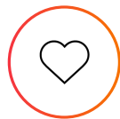
Charities and nonprofits