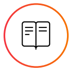
Premium publishers, news, and content